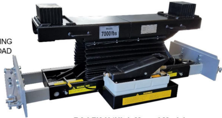
RAJ-7K-H 'High Mount' Model