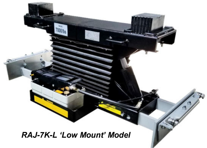
RAJ-7K-L 'Low Mount' Model